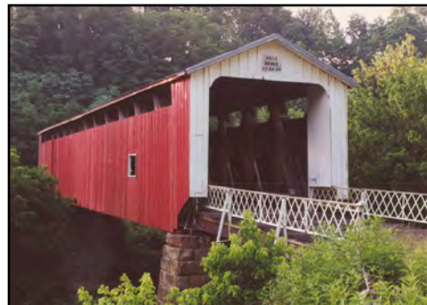
Hills Covered Bridge on the Covered Bridge Scenic Byway (above) and the Lake Vesuvius boardwalk (below).

Campgrounds, wildlife, and trails make the Wayne National Forest a popular destination point for outdoor recreationists. For current information on accessibility of sites, trails, making reservations, or rules and regulations, check our website or contact one of the Forest's offices.