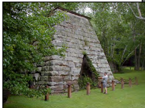
Vesuvius Furnace - Pedro, OH

The following lists some, but not all of the trails on the Wayne National Forest. The symbols represent the type of use allowed on the trail. There are no OHV trails on the Marietta unit. Horses, mountain bikes, and OHVs are required to stay on trails designated for their use and must have a valid Wayne National Forest permit.