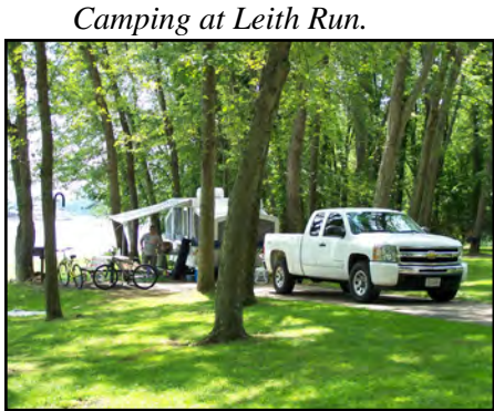
Camping at Leith Run.