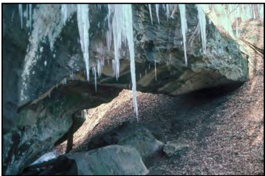
Irish Run Natural Bridge - Marietta Unit