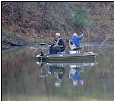
Fishing in Lake Vesuvius (left) and the Rutherford Wetland and Ora Anderson Nature Trail (right).